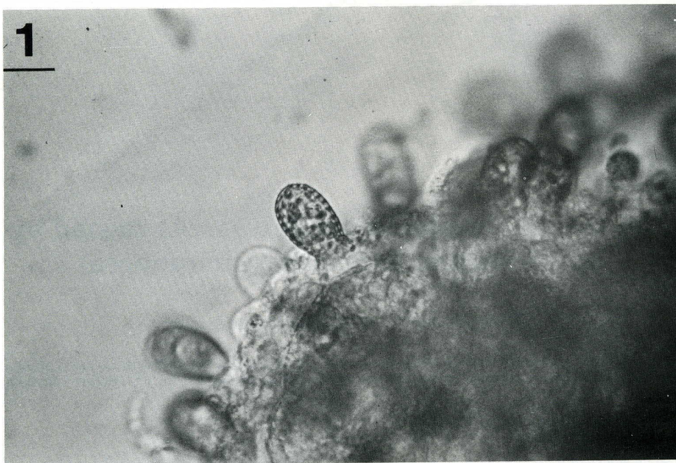
Fig. 1. Coleps sp. infecting goldfish Carassius auratus fry. Ciliates are attached to the epithelium with their cytotome. Bar = 32 \mu m