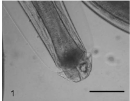
Figure 1. Head end of the nematode Paraquimperia tenerrima from the gut of a Lake Balaton eel. Fresh preparation. Measure of length: 0.2 mm.